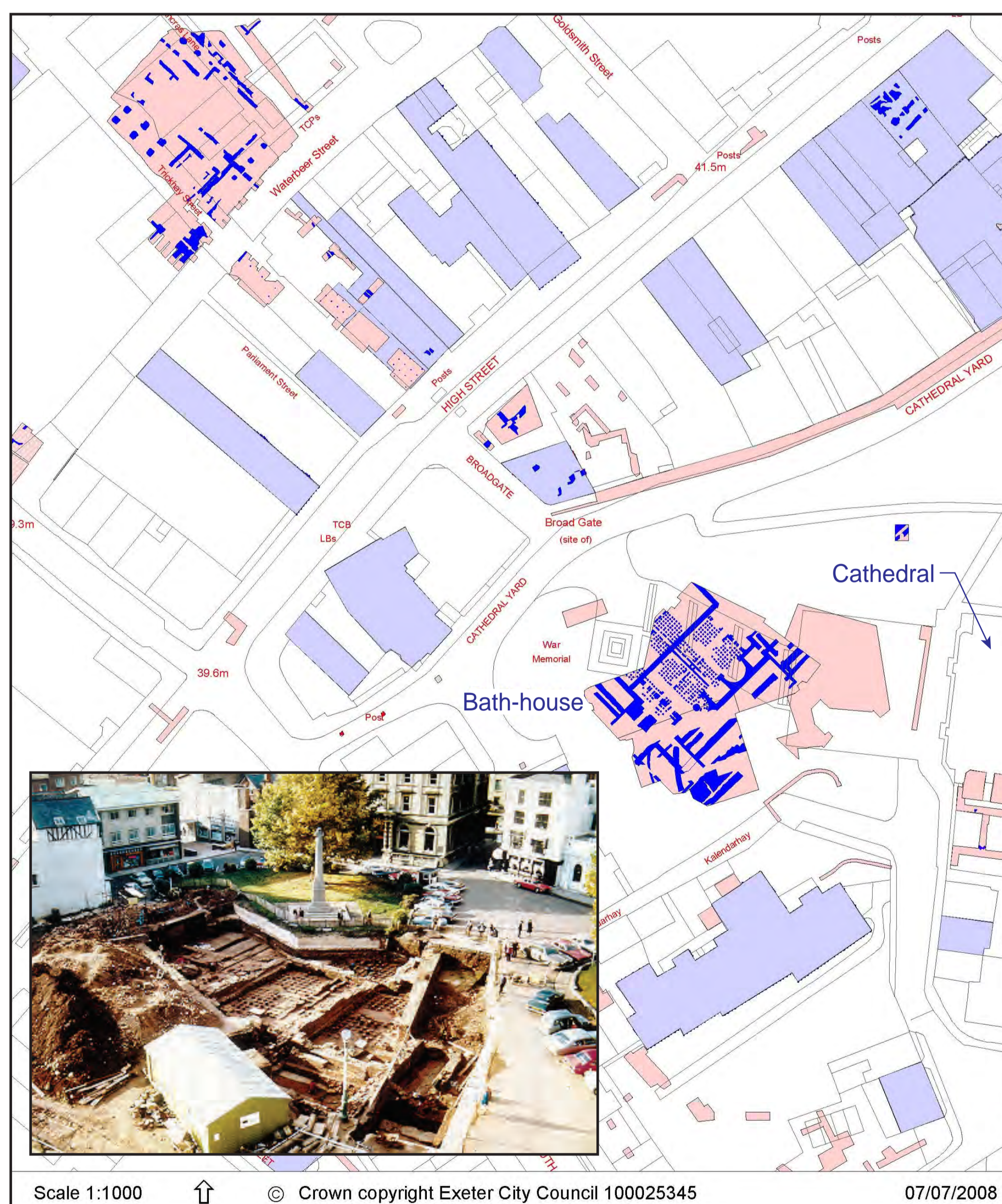
Example of the detailed information in the city HER: location of recording work (red - excavations, blue - buildings) and of buried remains (dark blue) of Roman legionary bath-house in front of the Cathedral and of military buildings under the Guildhall Centre. Inset: excavation of bath-house, 1972.