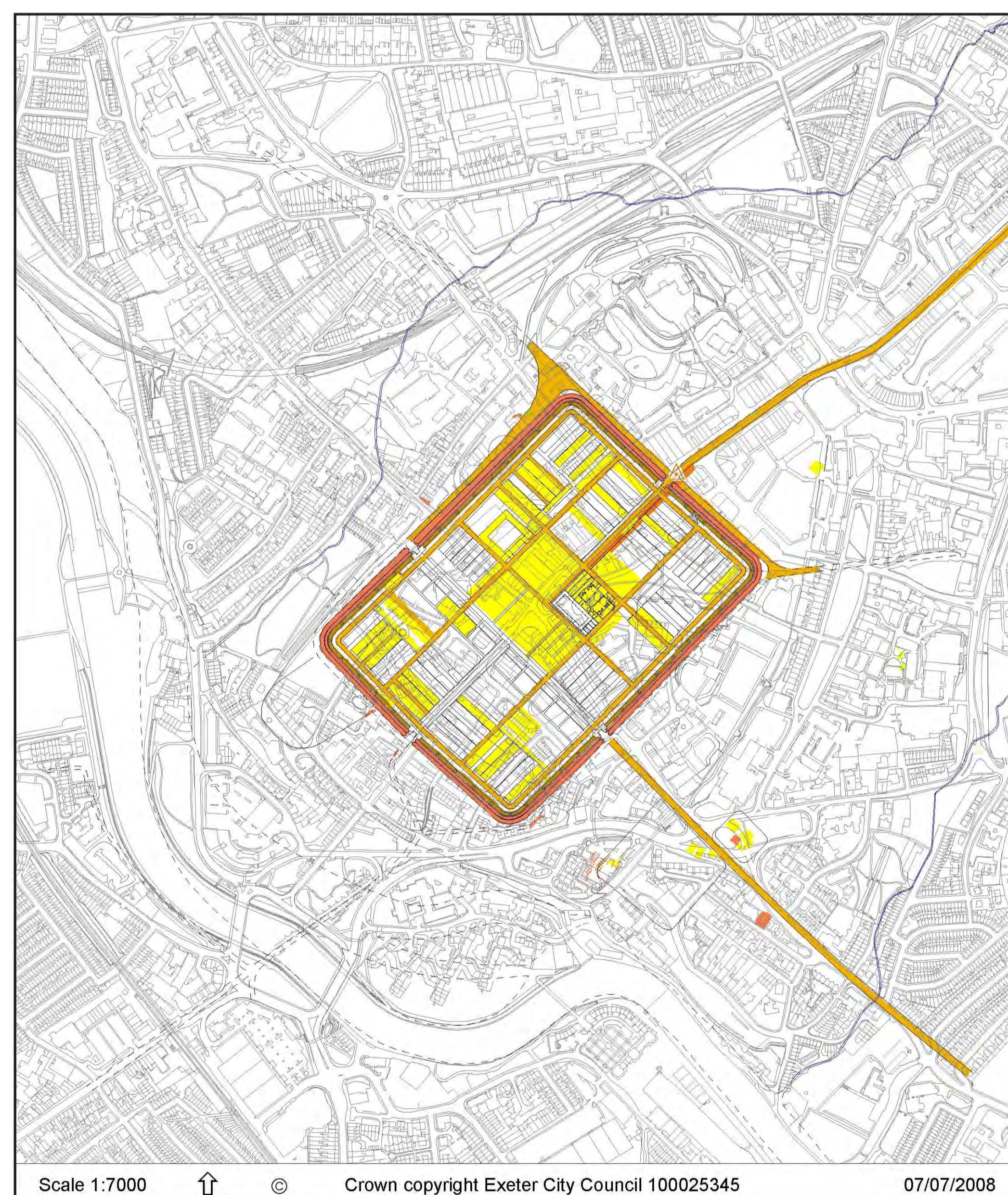
Example of the period reconstructions in the city HER: Roman legionary fortress underlying the city centre. Coloured shading represents known buildings, streets and the defences, projected features are shown in outline.