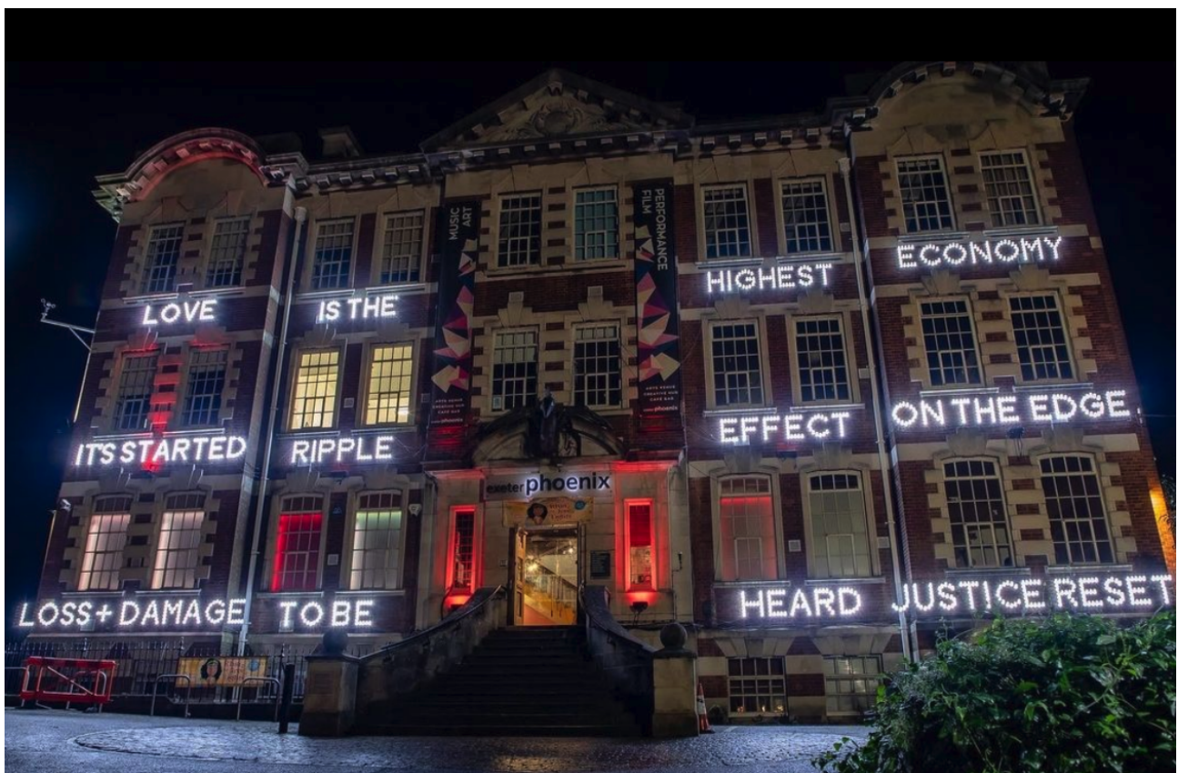
LOVE IS THE HIGHEST ECONOMY by Still Moving.

This report has been commissioned by Exeter City Council, in partnership with University of Exeter and Exeter Culture. It sets out new ways of thinking about Public Art in Exeter, focusing on how it can contribute to enhancing the city's unique heritage, culture and natural assets. Public Art is fundamental to place-making - a key strategy for the city.