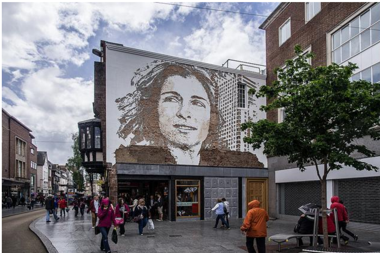
Urban Outfitters commission by Vhils. Exeter High Street, 2011.

Public Art can be a prototype as a part of testing activity, for the development of spaces. Jubilee Park in Gothenburg, Sweden, is a new project, on a former dockland site. The city had no concrete plan for what the development might hold, so invited a number of creative agencies to create prototype projects and structures. These include a sauna, an orchard park and a beach. This is a part of Prototyping Gothenburg - a method of using a ‘temporary permanence’ for the space between an industrial site and an urban neighbourhood (3-5 years) to be occupied with testing activity in partnership with the population of the city, and colouring and directing the final direction of developments.