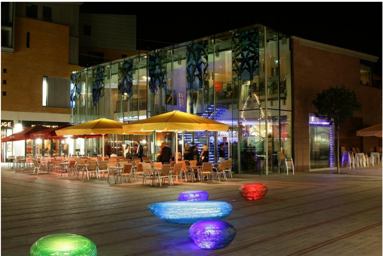
Exeter Traceries by Katayoun Pasban Dowlatshahi. Princesshay, 2006.