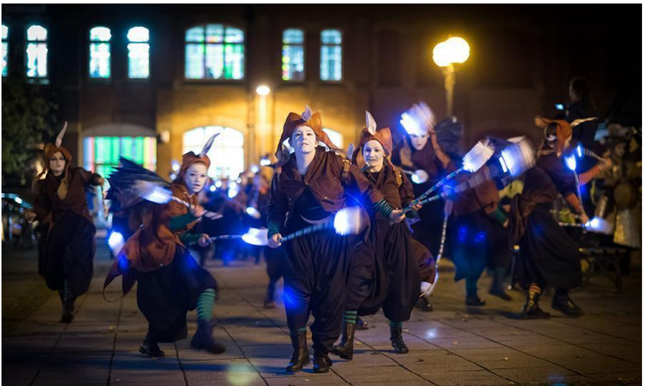
On Tenterhooks produced by Oceanallover, Exeter City Council and Burn the Curtain. Exeter Quay, 2016.