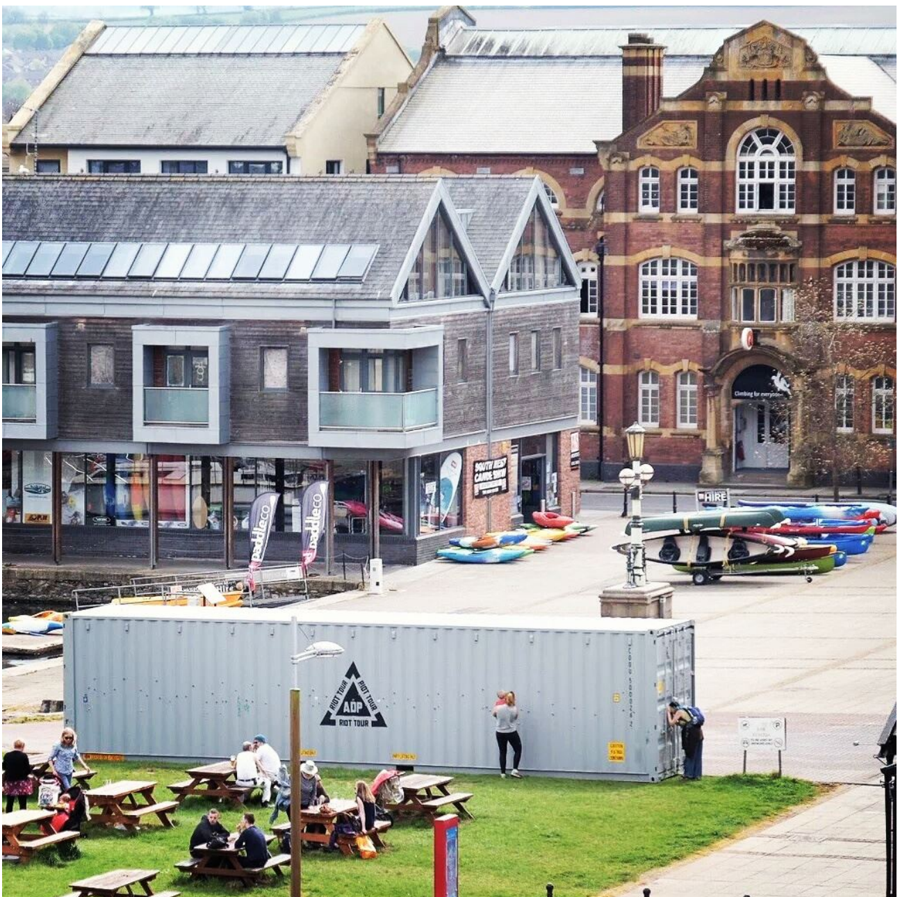
Aftermath Dislocation Principle by Jimmy Cauty. Commissioned by NOSE for Art Week Exeter. Exeter Quay, 2016.

The city has multiple initiatives for promoting itself internally and externally - Visit Exeter, Exeter Live Better and InExeter being the most prominent. They are mainly operating as a form of tourism-marketing, in service to the growing commercial and professional sector. There is potential to work with these initiatives to create a philanthropic initiative for funding cultural activity - from which they and the sectors they serve all benefit greatly.