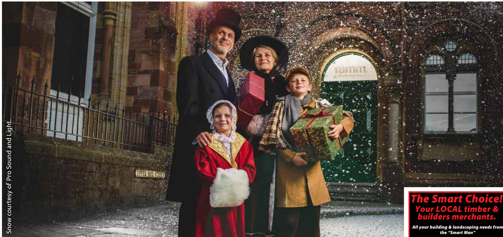
Snow courtesy of Pro Sound and Light.