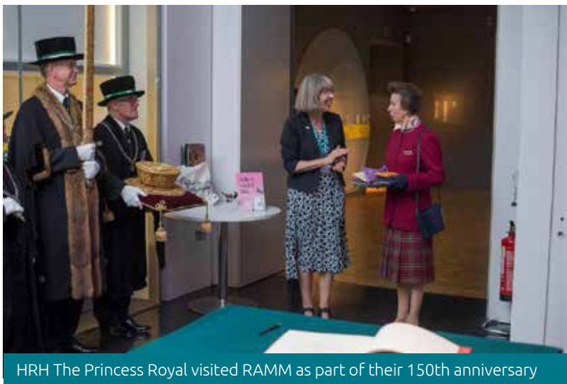
HRH The Princess Royal visited RAMM as part of their 150th anniversary

When signing up to RAMM Membership, visitors will complete a short quiz about their