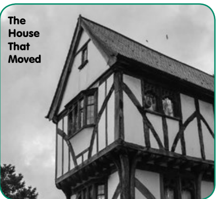
The House That Moved