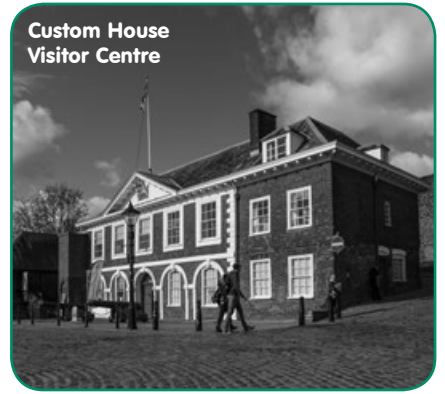
Custom House Visitor Centre

Please note, all prices include VAT at 20% and may be subject to change.